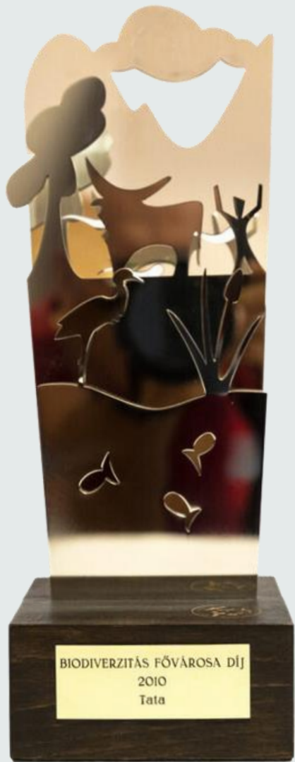
Capital of Biodiversity (2010)