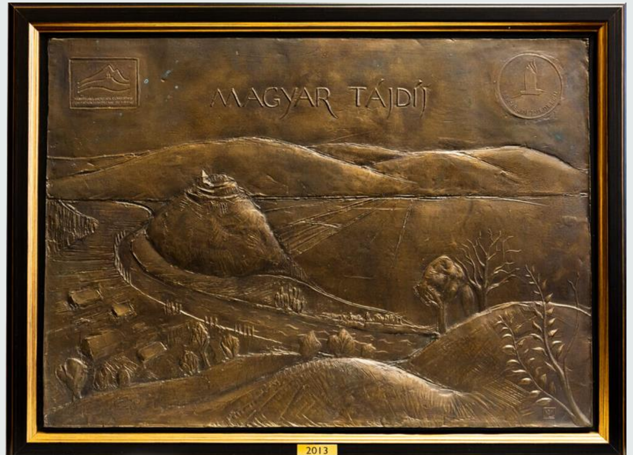
Hungarian Landscape Award (2013)